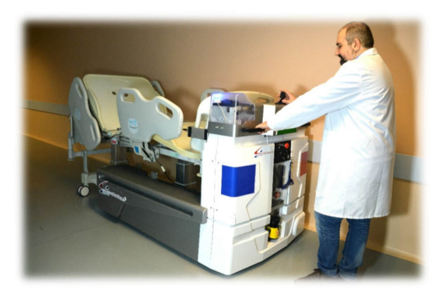
Assisted guidance for bed mover (see kedos-mit.com)